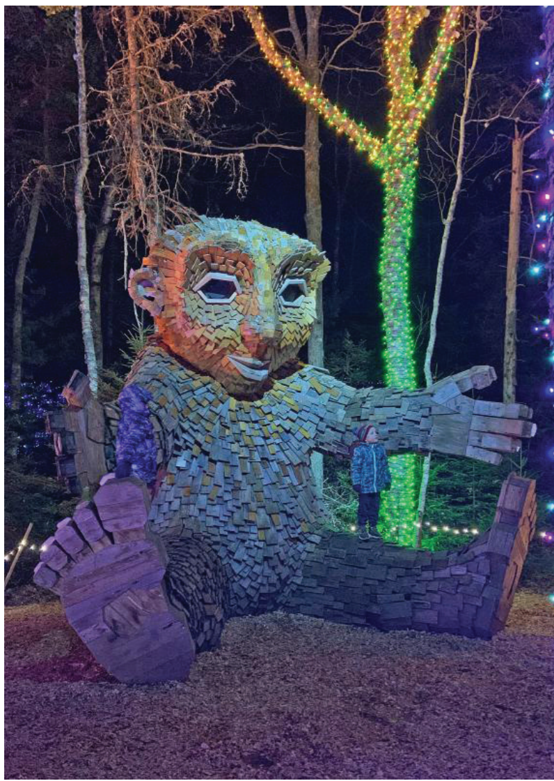
GARDENS AGLOW.