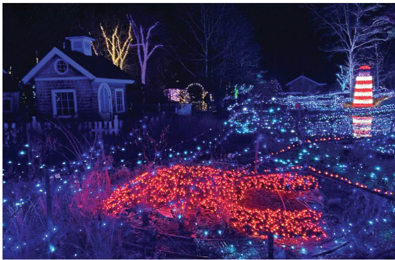
GARDENS AGLOW.