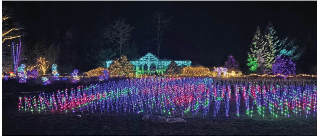
GARDENS AGLOW.