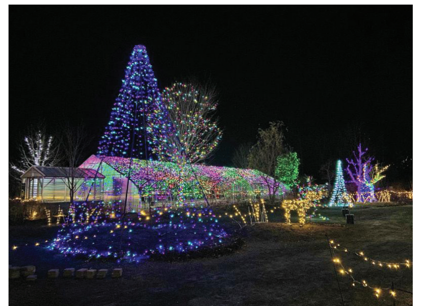
GARDENS AGLOW.