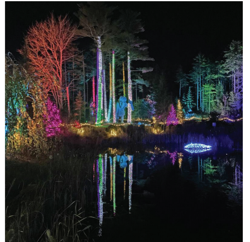
GARDENS AGLOW.