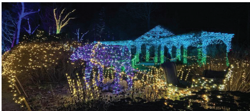
GARDENS AGLOW.