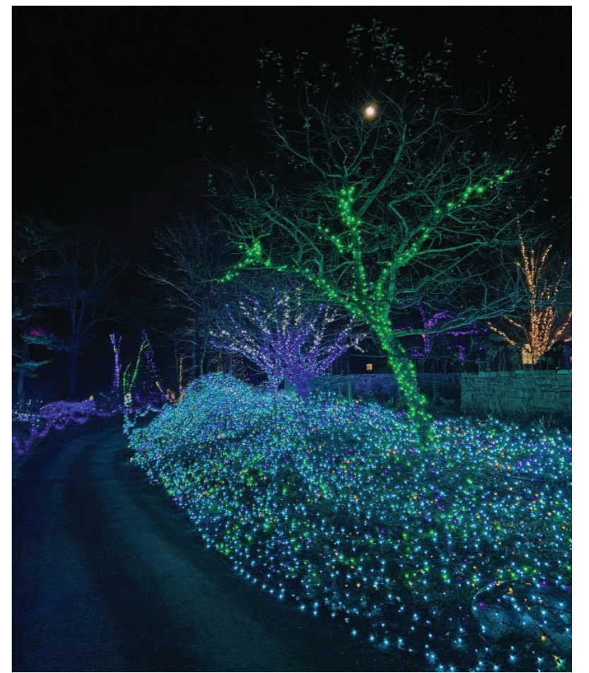
GARDENS AGLOW.