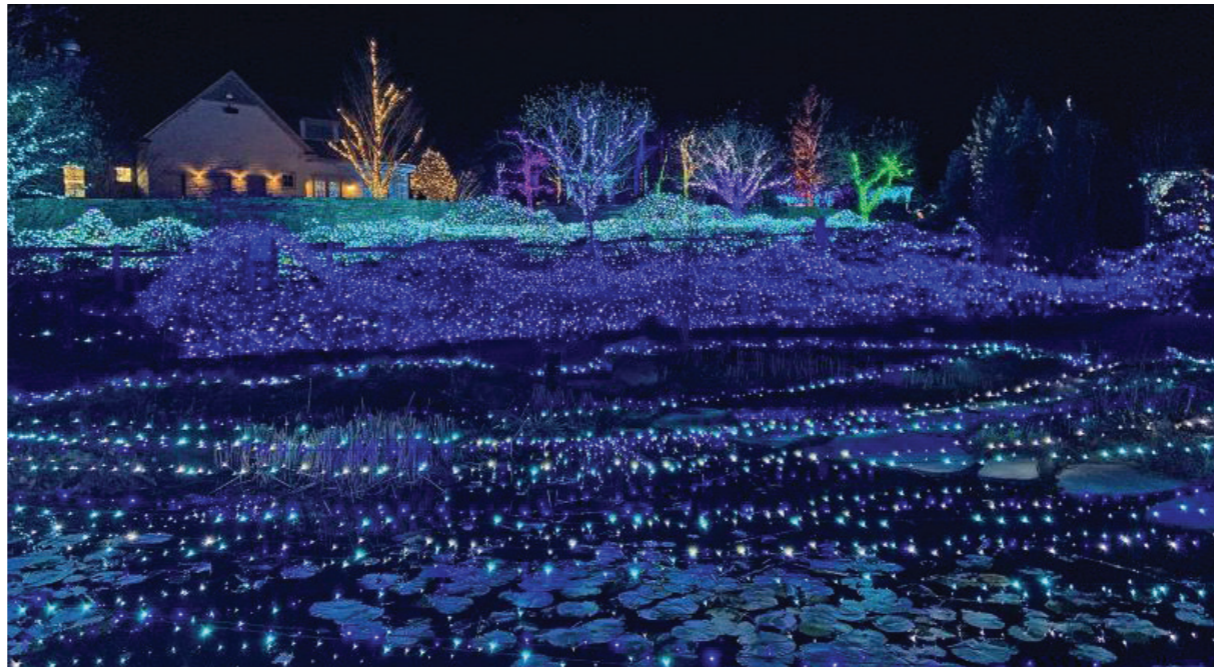
GARDENS AGLOW.

through Dec. 31. For more information and tickets, visit https://www.maine-gardens.org/events-exhibits/gardens-aglow/