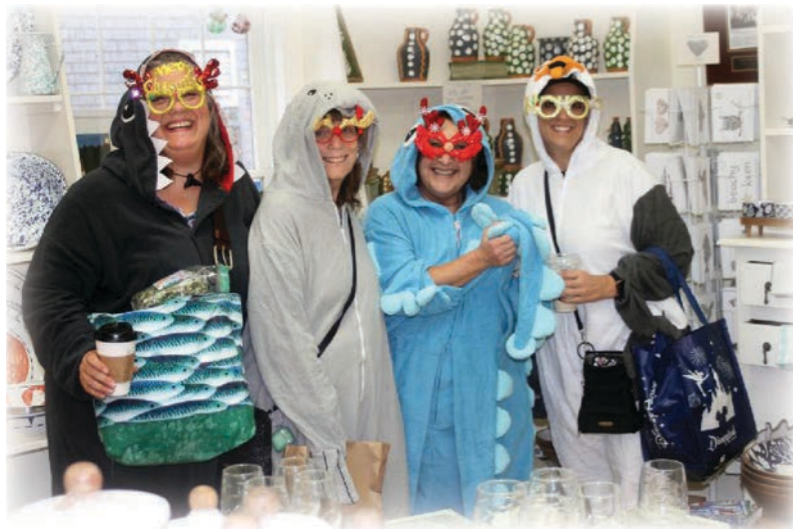
EARLY BIRD SALE & PJ PARTY is a shopper's dream - and a good time, too!